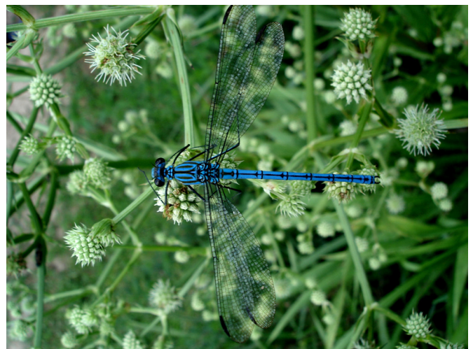
FIGURE 4. Heliocharis amazona Selys, 1853