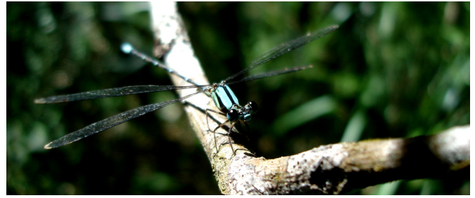
FIGURE 2. Heteragrion obsoletum Selys, 1886

Despite the fact that the number of species obtained was relatively high, collection efficiency by means of nonparametric estimators was 61%, indicating that collection effort was not enough to reveal the true richness of odonatofauna at Serra do Baú. Taking our knowledge about the Odonata fauna in environments similar to those of the Mata do Baú into account, we can state that further collection efforts would certainly allow other species to be found, especially in the Rio das Mortes, in which one or two species of Neoneura , one species of Elasmothemis , and other species of Gomphidae possibly occur. One should also consider that, when analyzed separately, the estimator 01 Jack differs from that of the collected species curve (cole) and indicates the stability of the species collected (Figure 5).