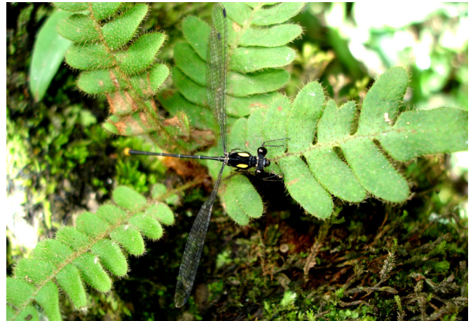
FIGURE 3. Heteragrion tiradentense (Machado and Bedê 2006)