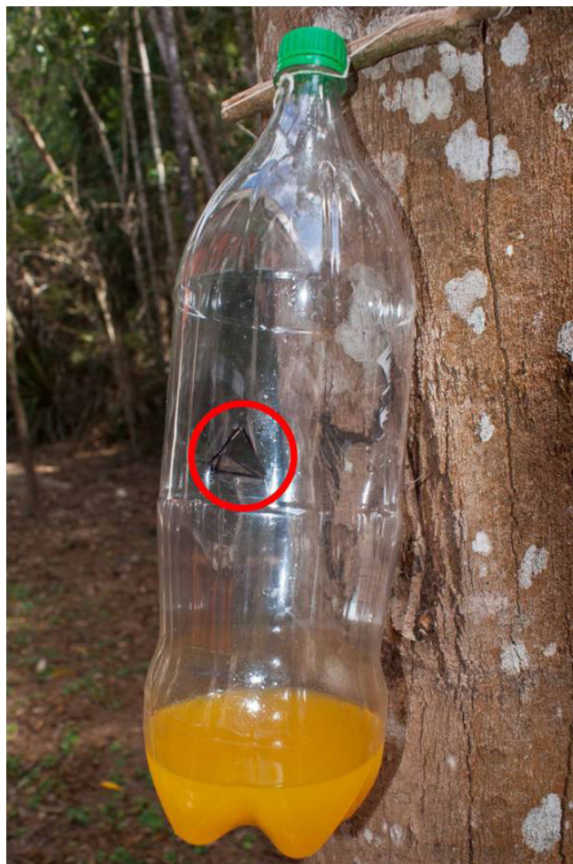
Fig 3. View of attractive trap in two-liter PET bottle, containing 200 ml of passion fruit juice and installed 1,5m above the ground on tree trunk. Inside the red circle the triangle-shaped of 2x2x2cm can be seen.

The attractive traps must be produced using two liters PET bottles, with three triangle-shaped openings on the side (2 X 2 X 2 cm) on the middle section (approximately 15 cm from the bottom) (Fig 3).