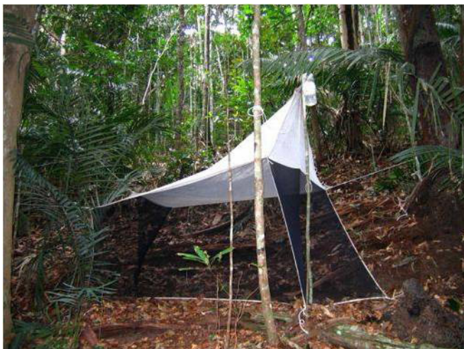
Fig 1. Malaise trap, assembled in the field.

The traps are built with a fine, lightweight and durable fabric – organza, nylon or bias are preferable – making an open tent, placed close to the ground, with a septum in the central area. If possible, make it with dark walls and light roof (Fig 1). This contrast between the colors and the bottom and top sections is essential to induce the insects to fly to the top, searching for the light while they are actually conducted the sampling container (Almeida et al., 1998). They can be assembled during all the study or be replaced to other areas, according to the logistics and the size of the sampled area. In wide areas, there must be used the most traps possible, located from 0.5 to 1km away from each other.